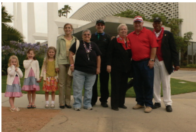
6 past mayors & 3 future