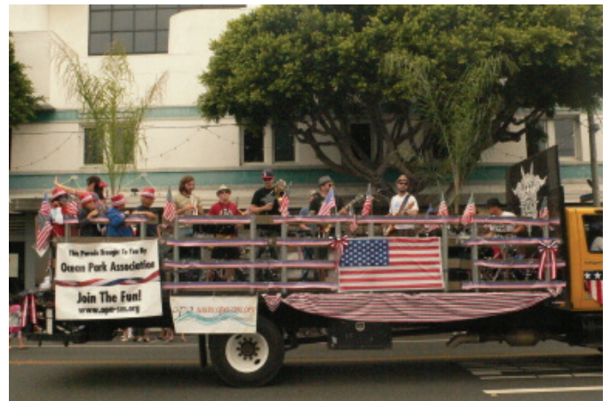
End of the parade