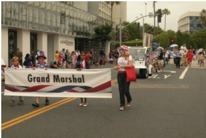
Grand Marshall Heal the Bay