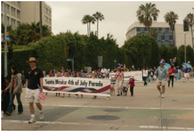
Start of Parade